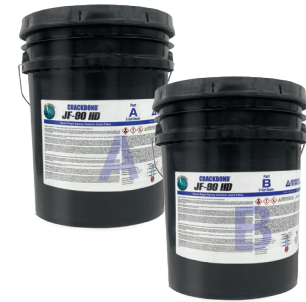
B5G-JF90-A / B5G-JF90-B